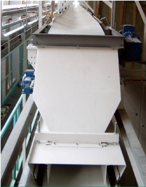
Trough conveyor belt with FDA approval for food products