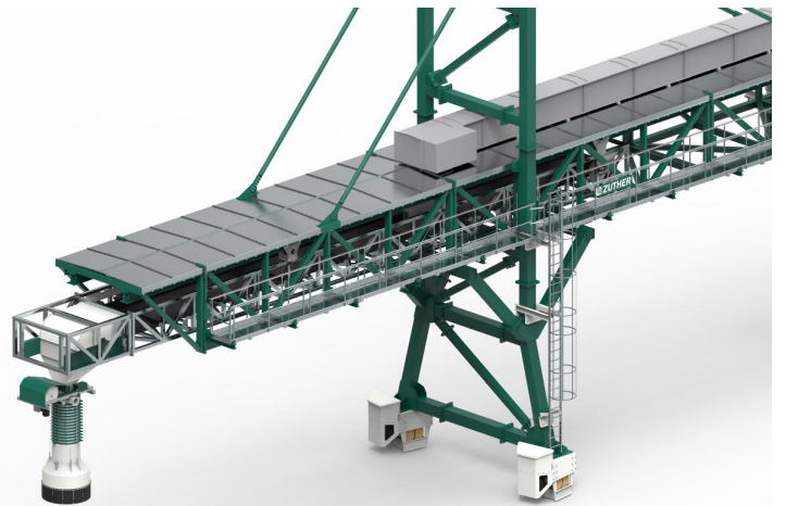
Trough conveyor belt as ship loading, 8 meters extendable, 525 t/h