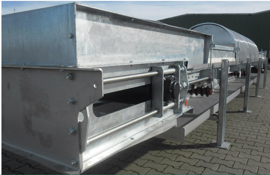
Connecting conveyor belt with 400 t/h capacity