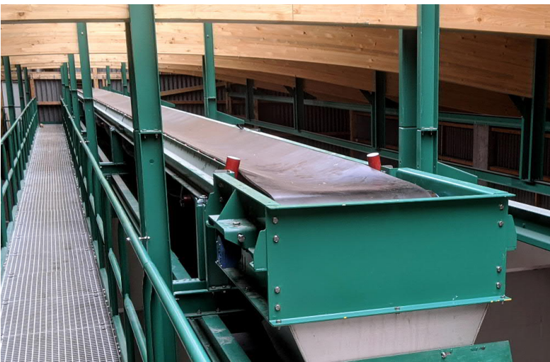
Troughed belt conveyor as part of the flat storage concept