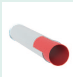
3 mm running pipe made of standard steel with wear lining