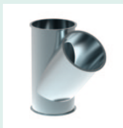
45° pipe branch with square ring made of 3 mm standard steel