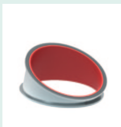
Pipe segment in 4 mm standard steel with wear lining